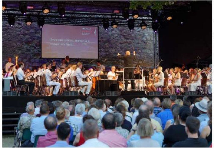
Photo Credit: Top Left photo by Silvia Casado; Concert photographs by Matthias Funk