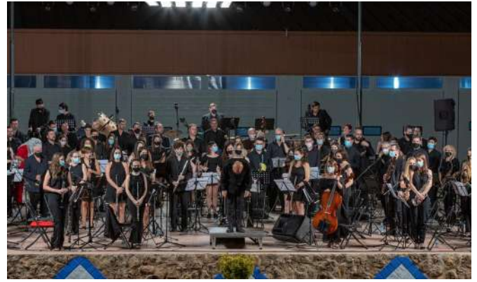
Photo on left of the choir provided by Marcelo Valerio. Photo on right of Ferrer Ferran conducting El Brillo del Fénix at the Estreno Mundial by Rufino Pardo Valverde

Including a choir he achieves his aims of a maximum possible participation—there aren't any limits—because he wanted to compose a piece for the people and that everybody should have chance to participate in a performance of this piece of music. The lyrics for the choir are very simple and easy. They only consist of 3 words: COVID – CORONAVIRUS - ALELUYA